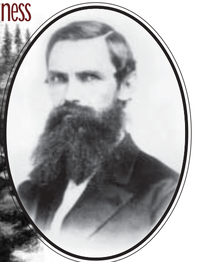
Porte Crayon Writer and Illustrator