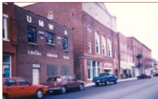
The town of Thomas today

Today, much of the Blackwater Canyon area has returned to scenic wilderness with the passing of the coal and timber booms. But its legacy remains. Help preserve this fascinating history and support economic development in northern West Virginia. Support the planning and development of the Coketon Industrial History Museum and Interpretive Center.