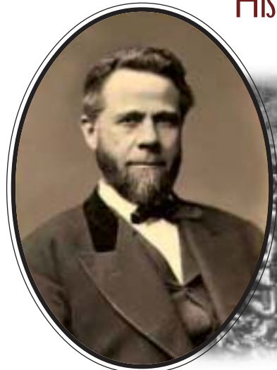
Henry Gassaway Davis West Virginia Industrialist